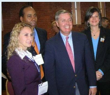
Lindsey Graham behalf of John McCain