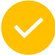
INTERNAL APPROVALS REQUIRED