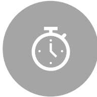
INTERNAL REVIEW/ROUTING PROCESS